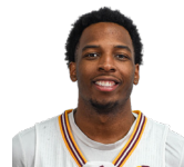
10 JOHNSON Sr. ▶ Guard

MIN. 21.3 PPG 8.4 RPG 2.8 APG 0.4 FG% 37.6 3FG% 32.1