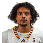
4 TALFORD Sr. ▶ Forward

MIN. 25.0 PPG 13.8 RPG 5.7 APG 1.0 FG% 50.7 3FG% 34.4